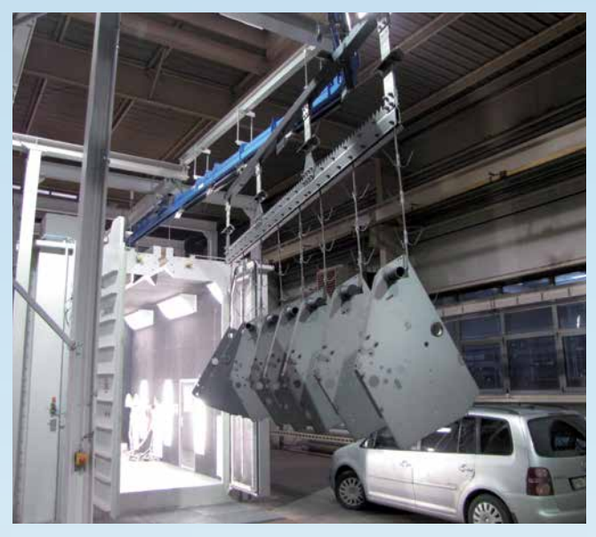
Continuous overhead rail shot blast plant for structural elements