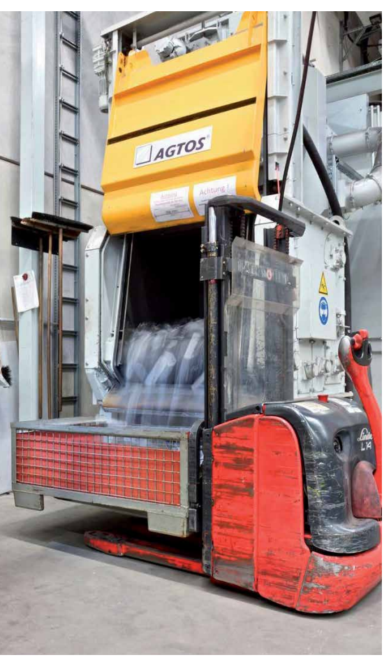
Rubber belt tumble blast machines for shot blasting small parts