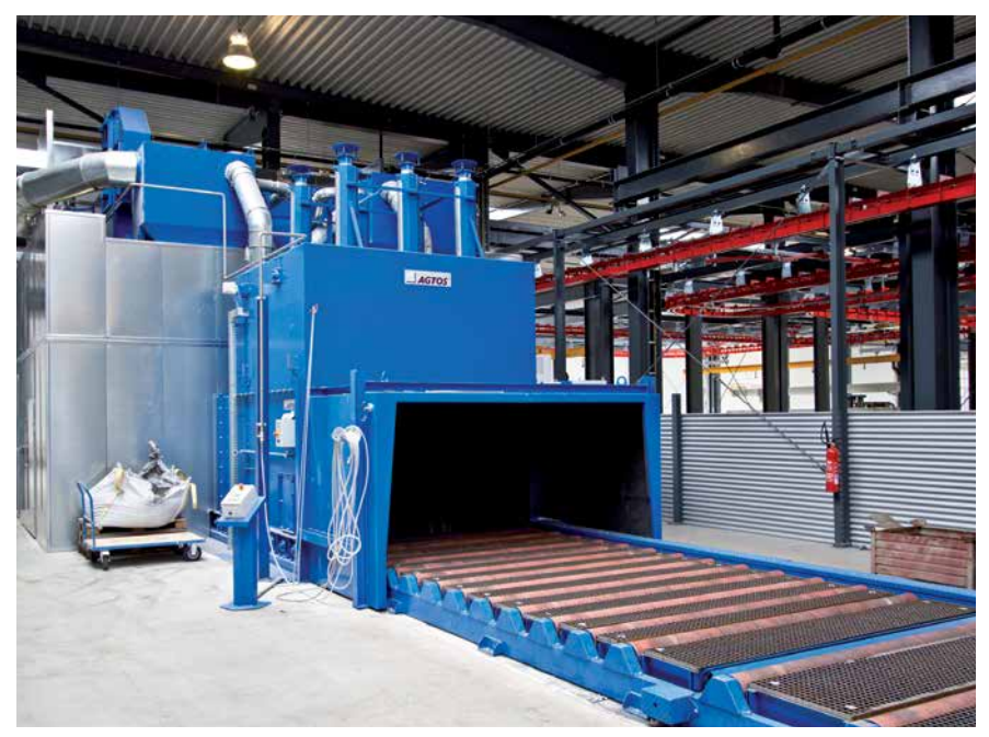
Roller conveyor blast machine for cleaning welded designs