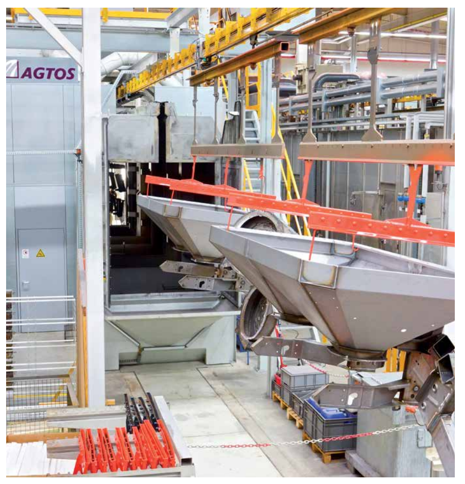
Continuous overhead rail shot blast plant for descaling and cleaning of fertiliser and seed spreaders