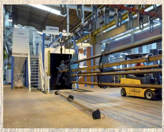
Continuous overhead rail shot blast plant for cleaning welded designs