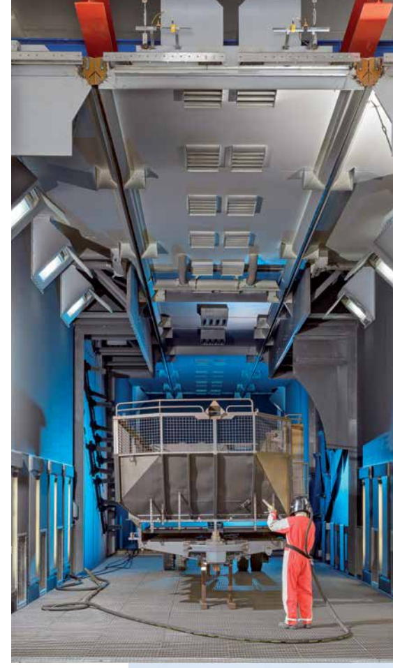
If the turbines did not shot blast some surface areas, these areas can be subsequently shot blasted manually.

After shot-blasting, the components are also iron-phosphated and passivated. After coating and burn-in of the paint at 200 °C, a resistance that will exceed 1,000 hrs is achieved for the salt spray test.