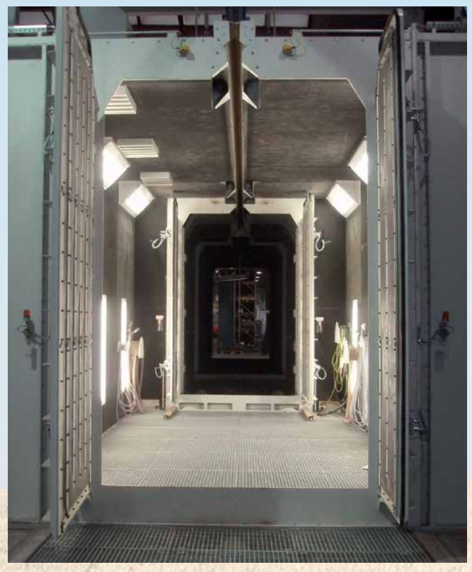
Continuous overhead rail shot blast plant for welded structures with a manual after blast and blow-off room