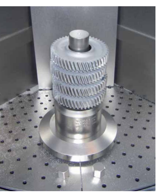
Satellite turntable blast machine for strain hardening of transmission parts