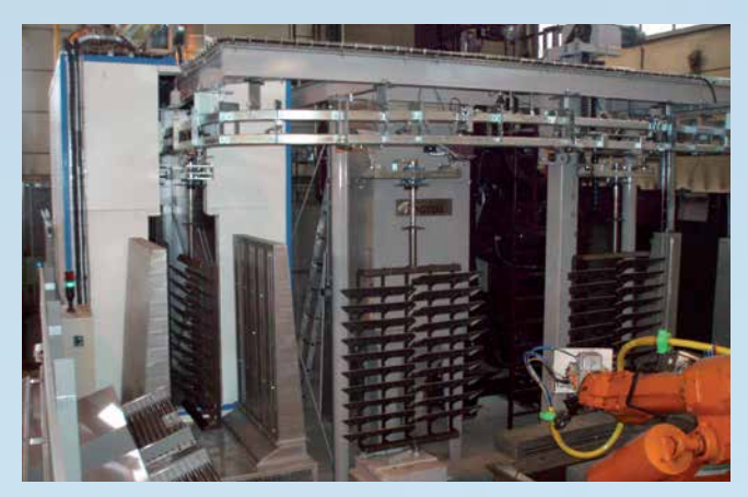
Continuous overhead rail shot blast plant for cleaning blank parts